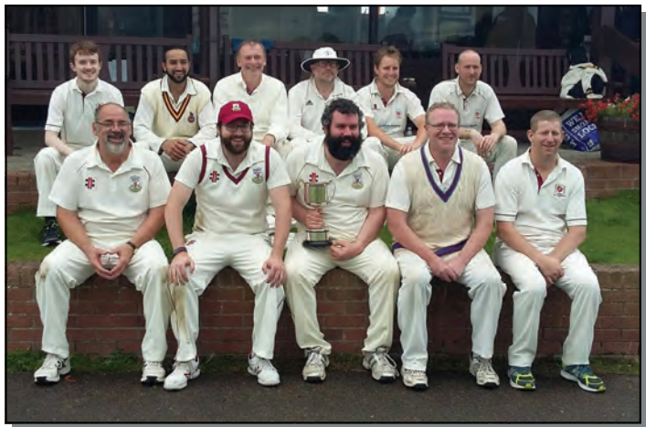
Forres St Lawrence CC NoSCA Senior T20 Champions 2017