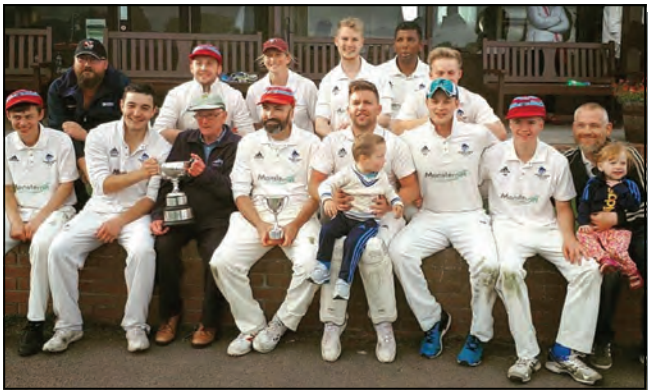
Northern Counties Cricket Club NoSCA Senior Cup Winners 2017