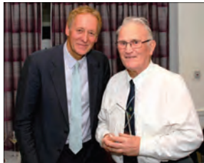
Ken Ross Lifetime Achievement Award